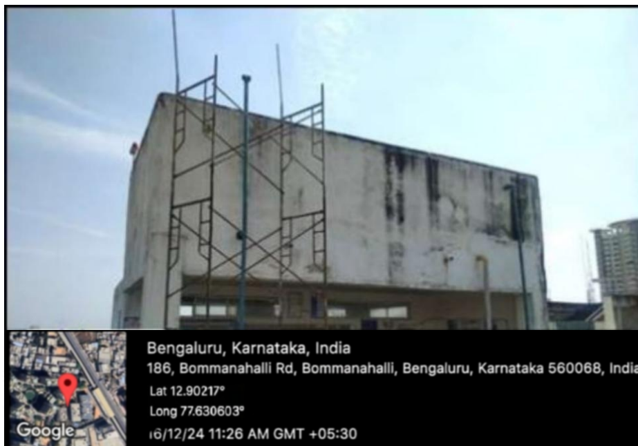
Over head tank in the Old building