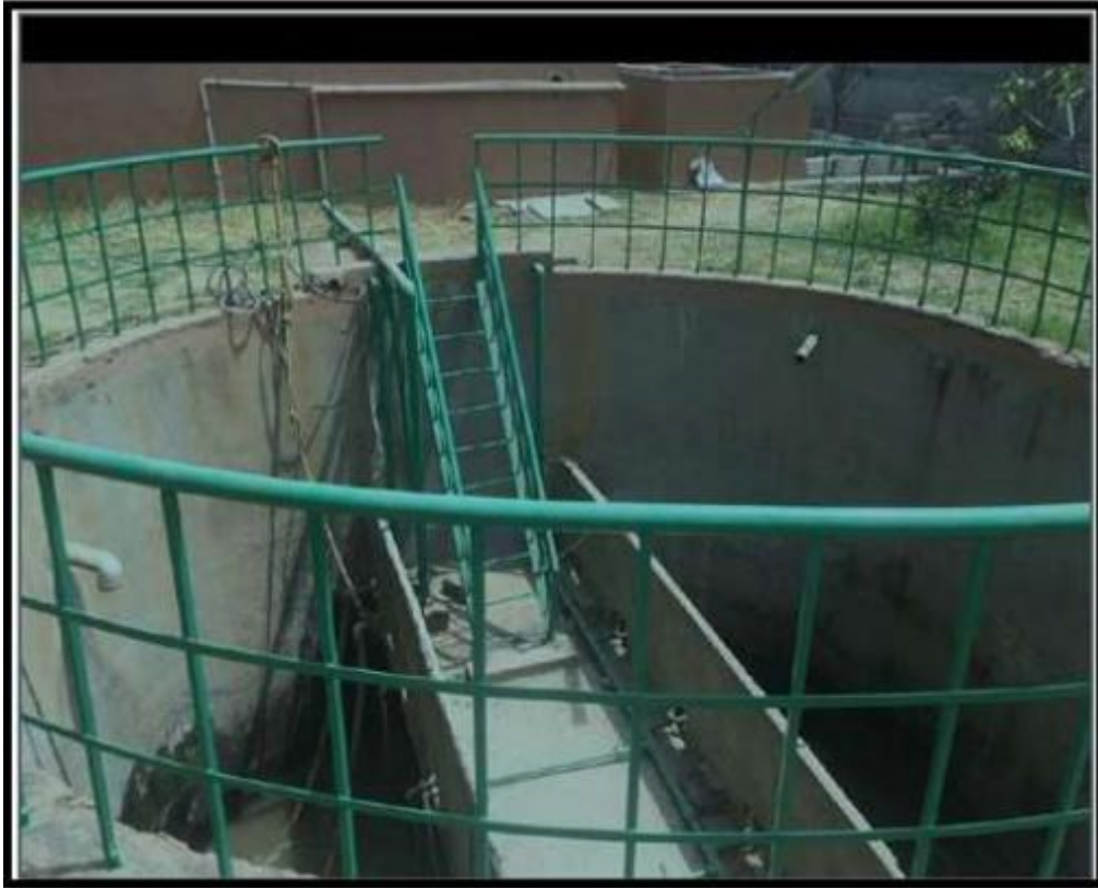
Recycling of waste water process

E-mail: engprincipal@theoxford.edu Web: www.theoxfordengg.org