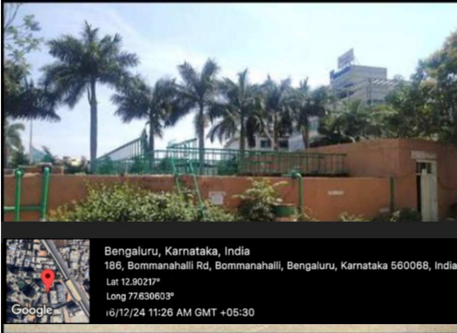
Collection of waste in settling tank

E-mail: engprincipal@theoxford.edu Web: www.theoxfordengg.org