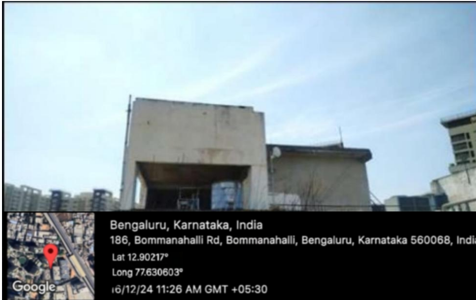
Overhead Tank in the New building

E-mail: enoprincipal@theoxford.edu Web: www.theoxfordengg.org